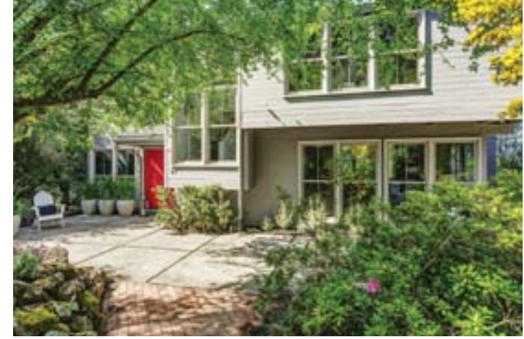
67 Loma Vista, Orinda 5 Bed 3 Bath 2,313 Sq Ft $1,425,000