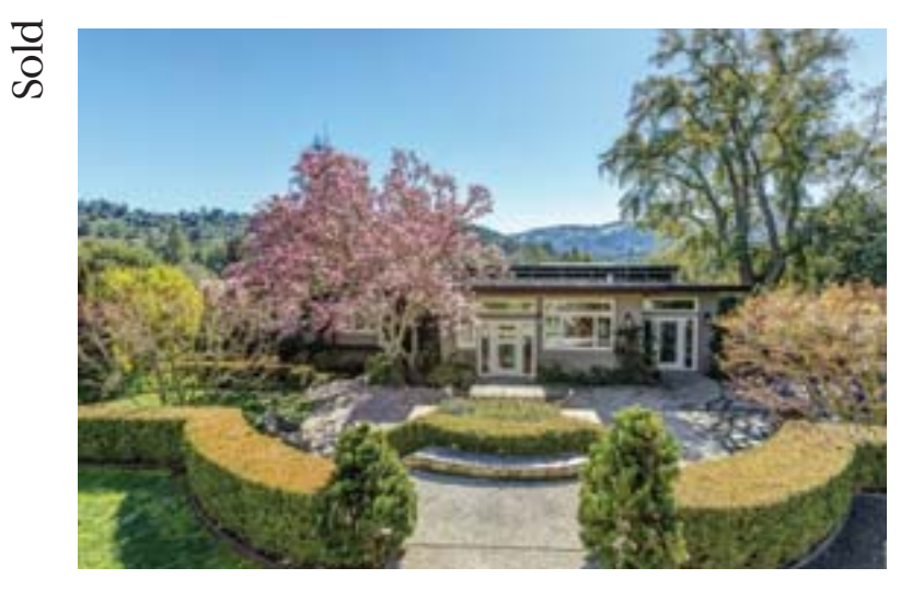
41 Van Ripper, Orinda 5 Bed 3 Bath 3,367 Sq Ft $2,075,000 Co-Listed with Suzi O'Brien