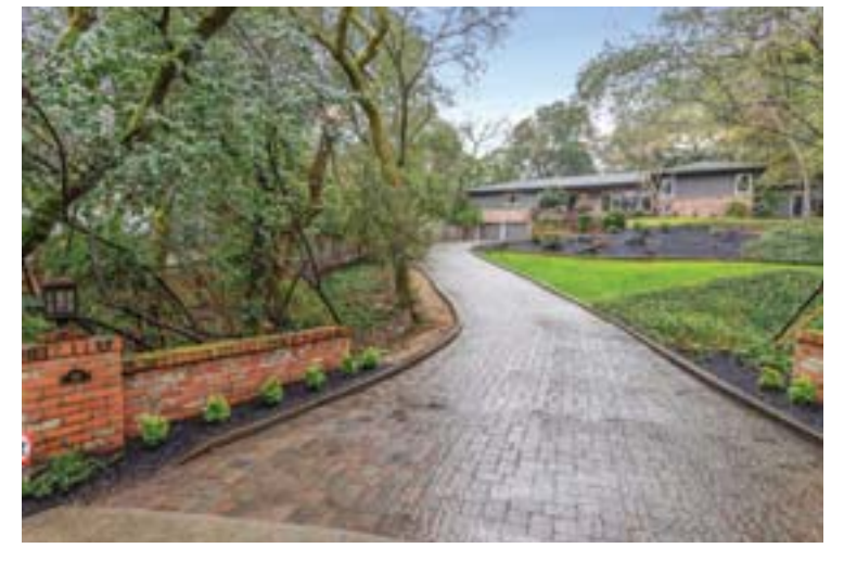
88 Camino, Encinas, Orinda 4 Bed 2 Bath 2,876 Sq Ft 0.60 Acres $1,800,000